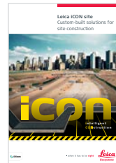
Leica iCON site Brochure