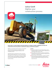
Leica ConX Flyer