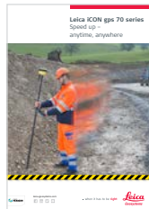
Leica iCON gps 70 Series Brochure

Illustrations, descriptions and technical data are not binding. All rights reserved. Printed in Switzerland – Copyright Leica Geosystems AG, Heerbrugg, Switzerland, 2022. 959264 en – 09.22